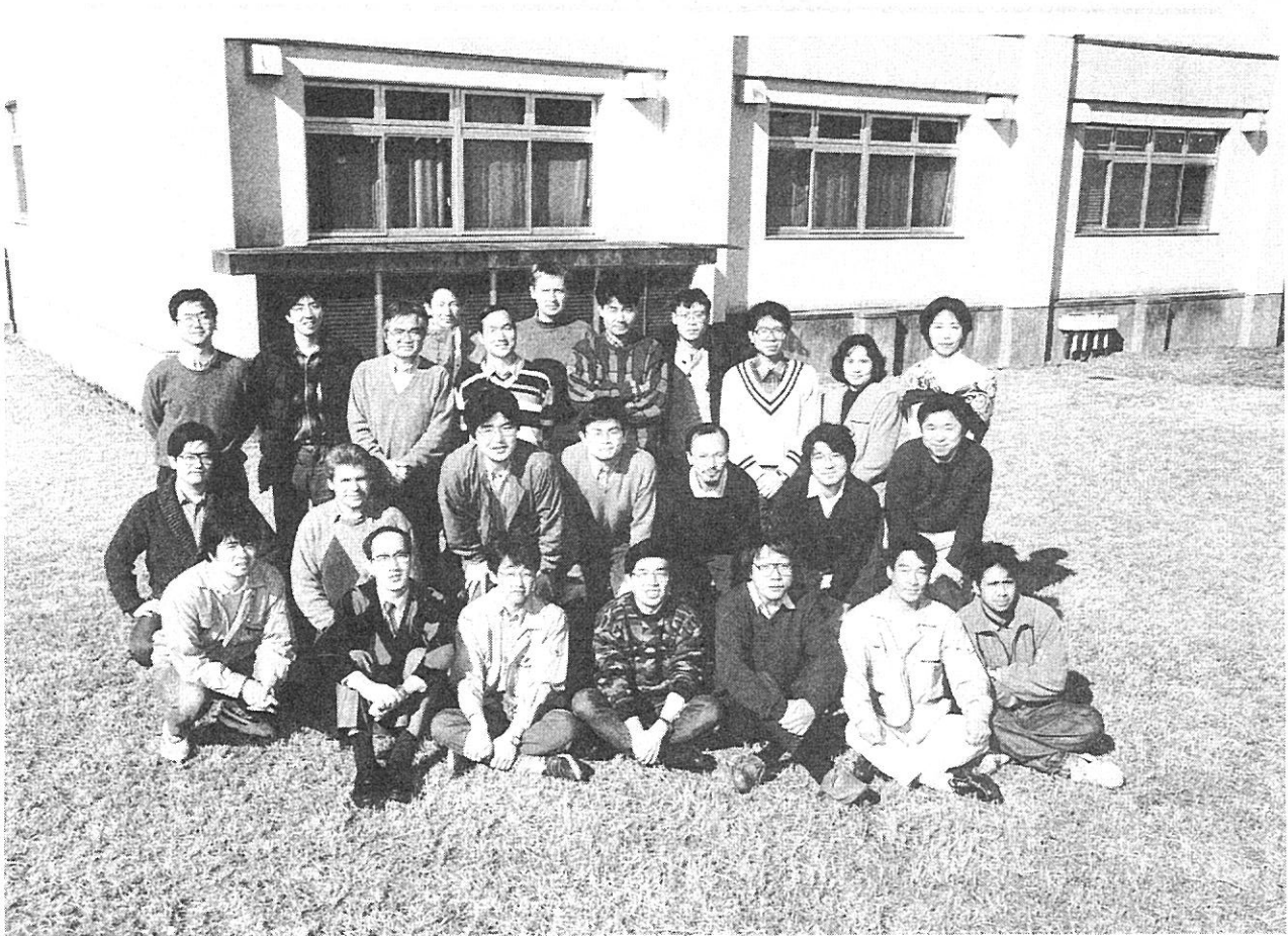
UVSOR members and users.