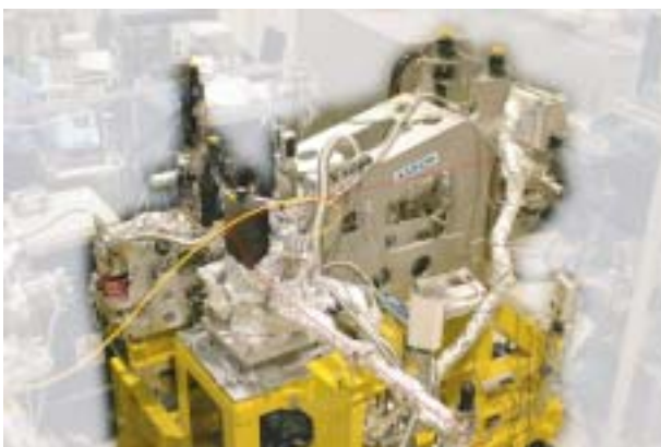
Novel Transmission-Grating Spectrometer for Soft X-Ray Emission Studies at BL3U