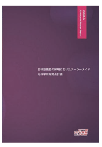
"Conceptual Design Report"